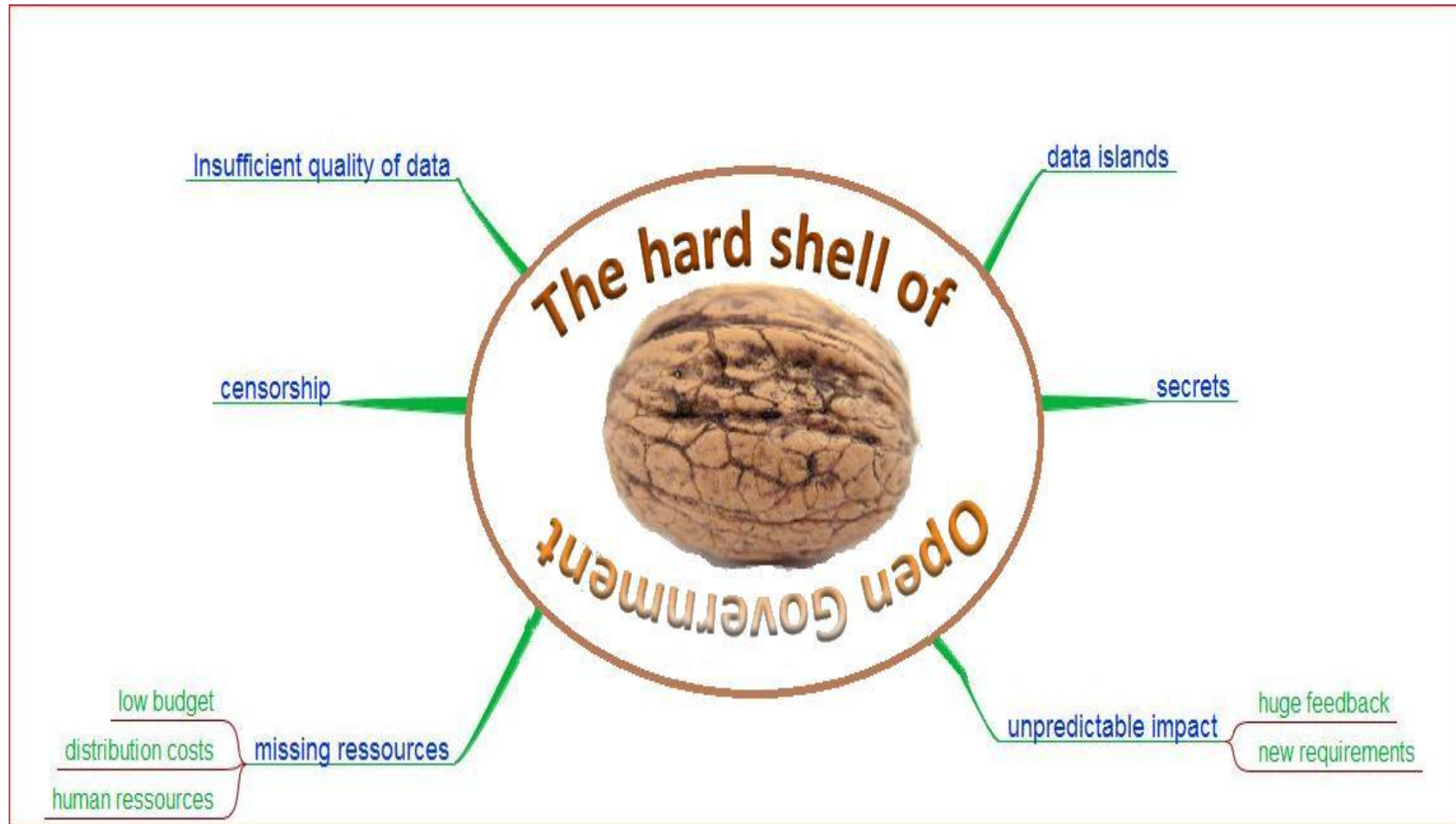
Figure 1: The hard shell of Open Government (B. Lutz, 2012)